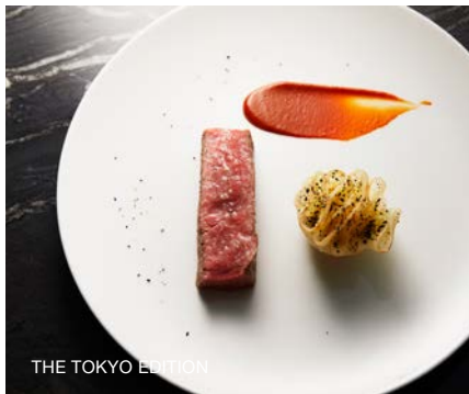
THE TOKYO EDITION