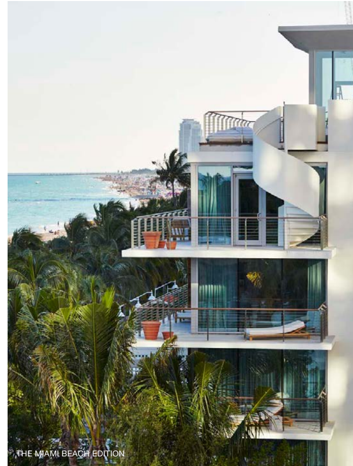
THE MIAMI BEACH EDITION

EDITION HOTELS ARE STUNNING MICROCOSMS OF THE WORLD'S TOP CITIES FEATURING THE BEST IN SERVICE, FOOD, BEVERAGE AND ENTERTAINMENT.