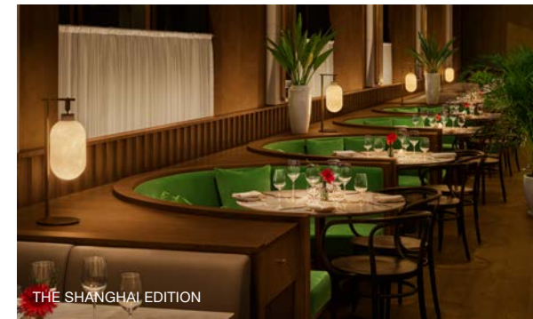
THE SHANGHAI EDITION

Envisioned by Ian Schrager and Marriott International, EDITION is a personal and unique hotel experience, and it is a collaboration that has served us and our guests well.