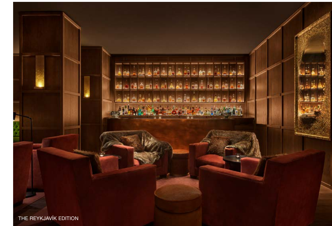
THE REYKJAVIK EDITION

Our desire is to infuse emotion into a check-in/ check-out world by bringing each location to life in an intimate, seductive environment.