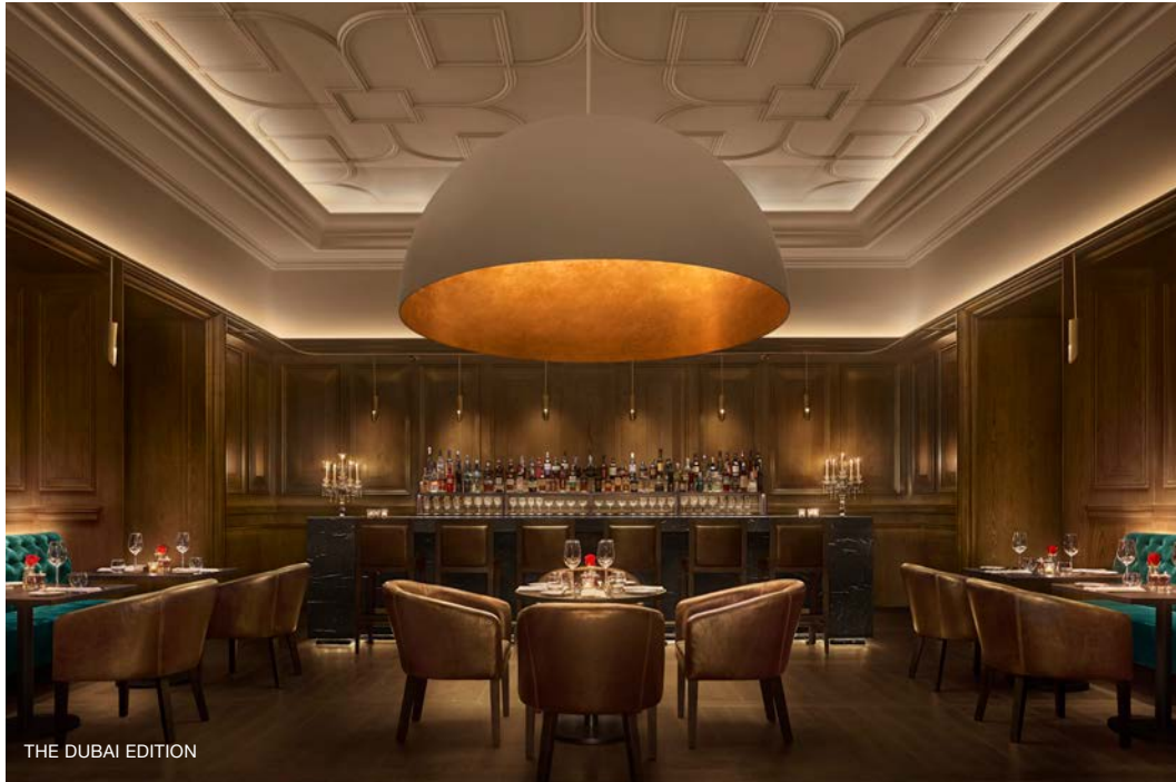
THE DUBAI EDITION