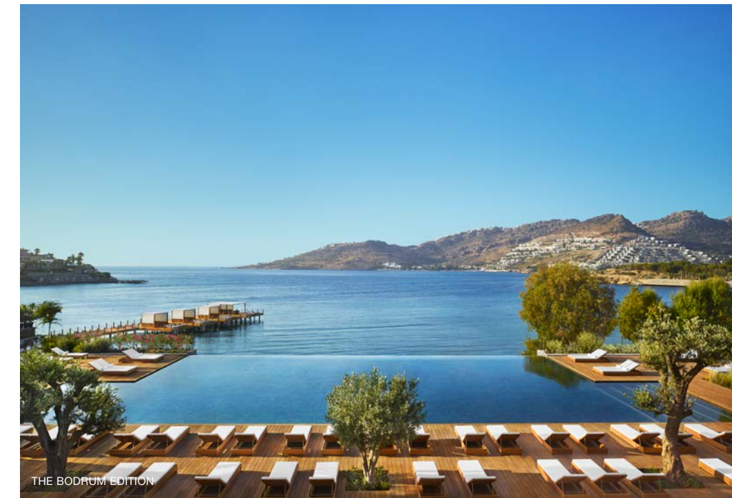
THE BODRUM EDITION

Located in gateway cities throughout the world, these are hotels where you'll find guests rubbing elbows with locals because there's no better place to be in the moment. Hotels that feel different because they make you feel something. Hotels that don't act like hotels.