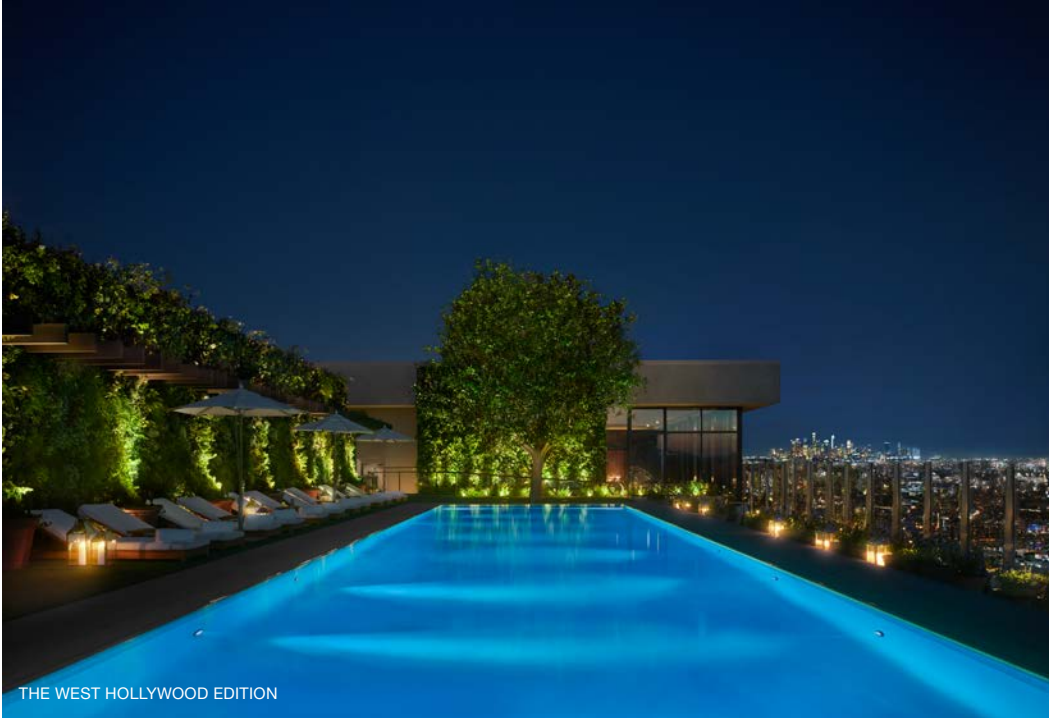
THE WEST HOLLYWOOD EDITION