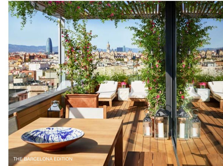
THE BARCELONA EDITION