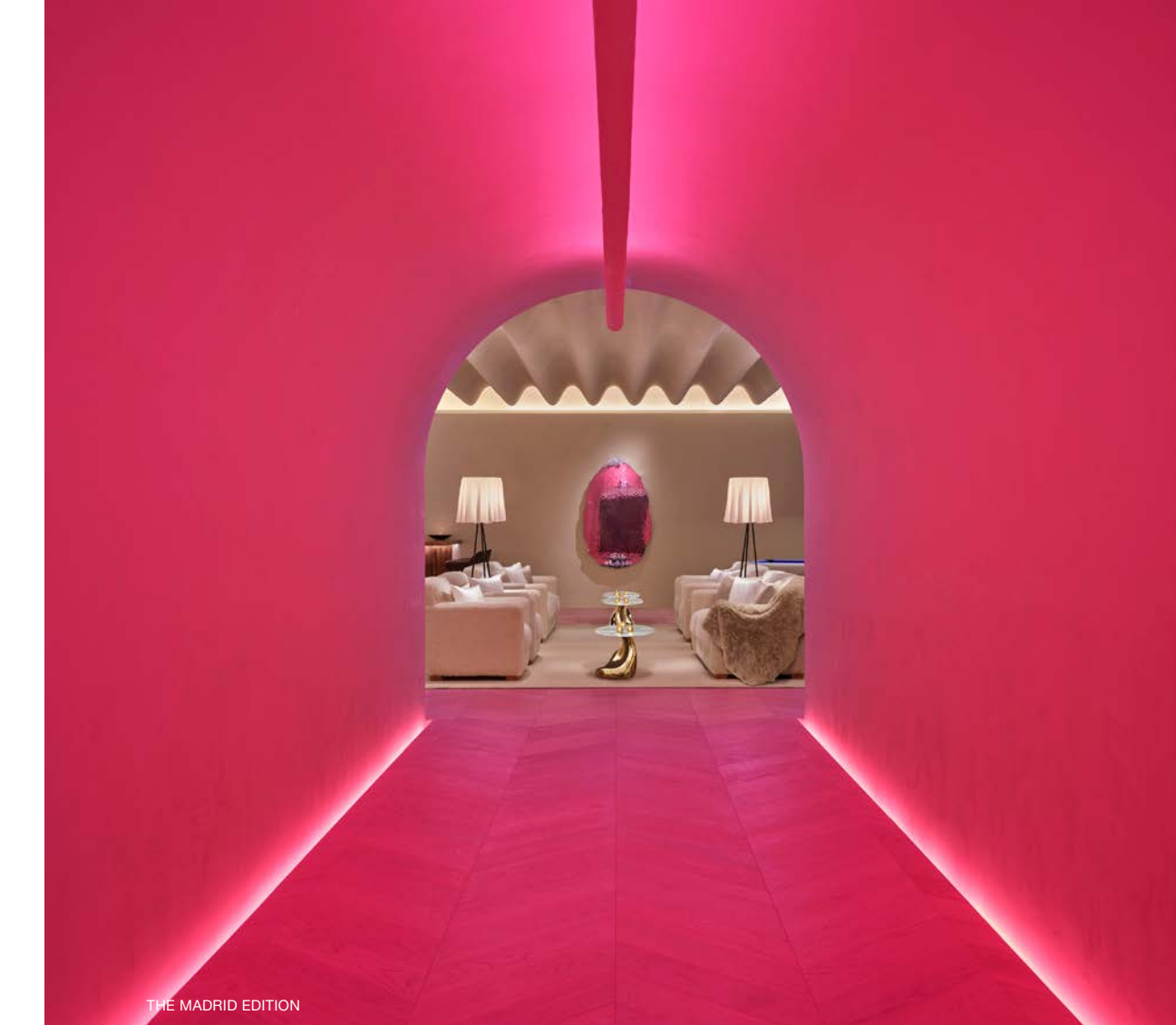
THE MADRID EDITION