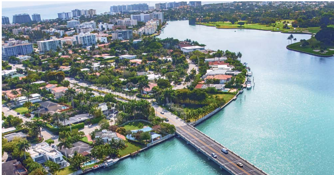
BAY HARBOR ISLANDS

From Aventura and Sunny Isles to the downtown skyline and panoramas of Biscayne Bay, residents enjoy unparalleled access to Miami's most sought-after areas. Relax at home in a quiet enclave at Solana Bay or embrace South Florida's nearby signature shopping, five-star dining, and world-class entertainment. The options are endless.