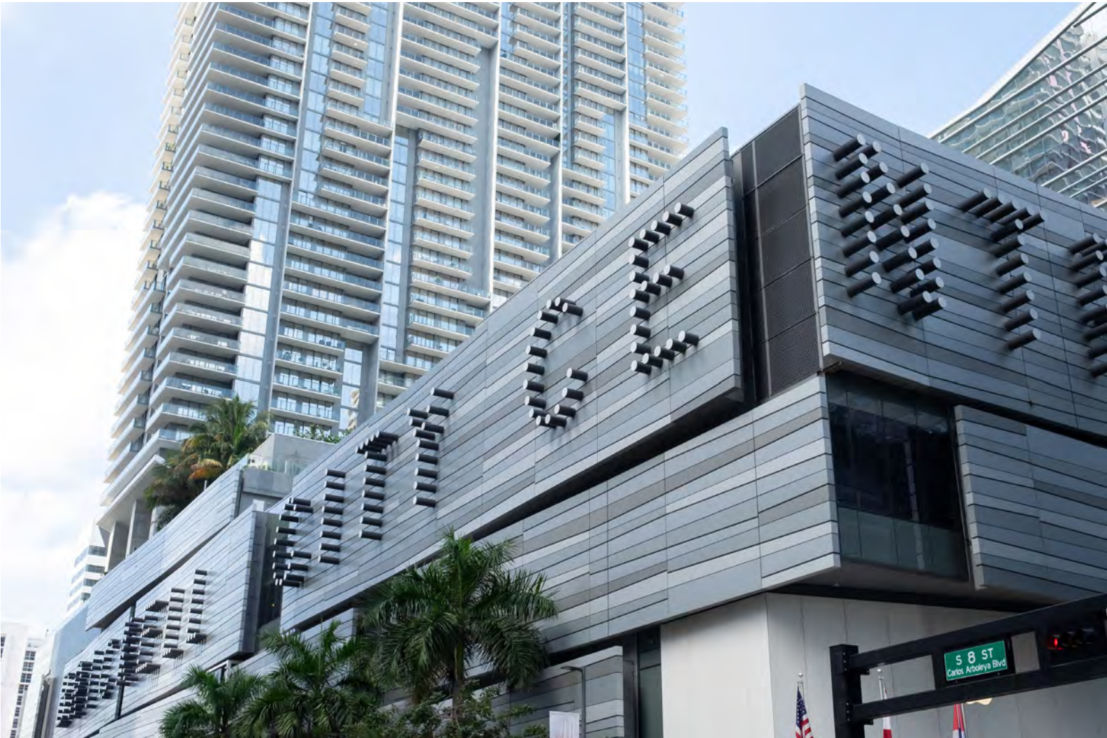
Left Page: Brickell City Centre