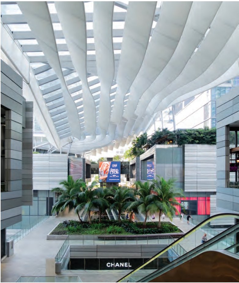
Right Page: Pérez Art Museum, Brickell Shopping, Cipriani Downtown Miami